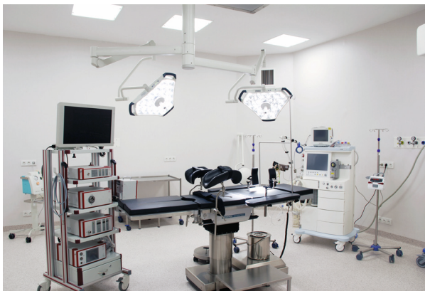
Private OFM Hospital – Antalya / Turkey

SIMEON surgical lamps offer high flexibility thanks to their light-weight lamp headers and provide an perfect quality and eye-friendly light with unique shadow resolution feature, thanks to their modern LED technology and we are proud and pleased to hear the positive comments from our customers, using our products. SIMEON lights are being effectively used in the hospitals both in Turkey and worldwide. As reference hospitals, we can refer to the most advanced hospitals in Turkey such as the Medical Park Hospitals Group, Medicana Hospitals Group, World Eye Hospitals Group and American Hospital of the Koc University and the Apollo Hospitals Group in India and the Clinica San Martino in Italy and the SCM Cracow in Poland.