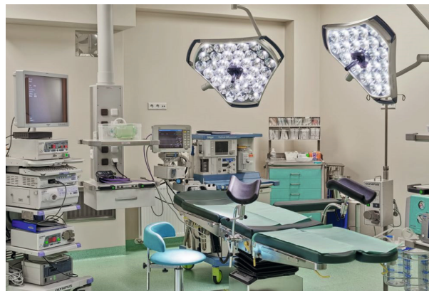
SCM Cracow – Poland