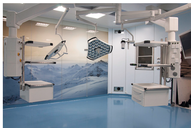
Clinica San Martino – Malgrate / Italy