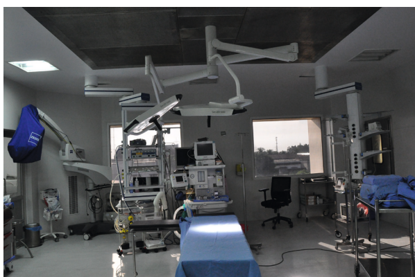
Apollo Hospitals Group – India