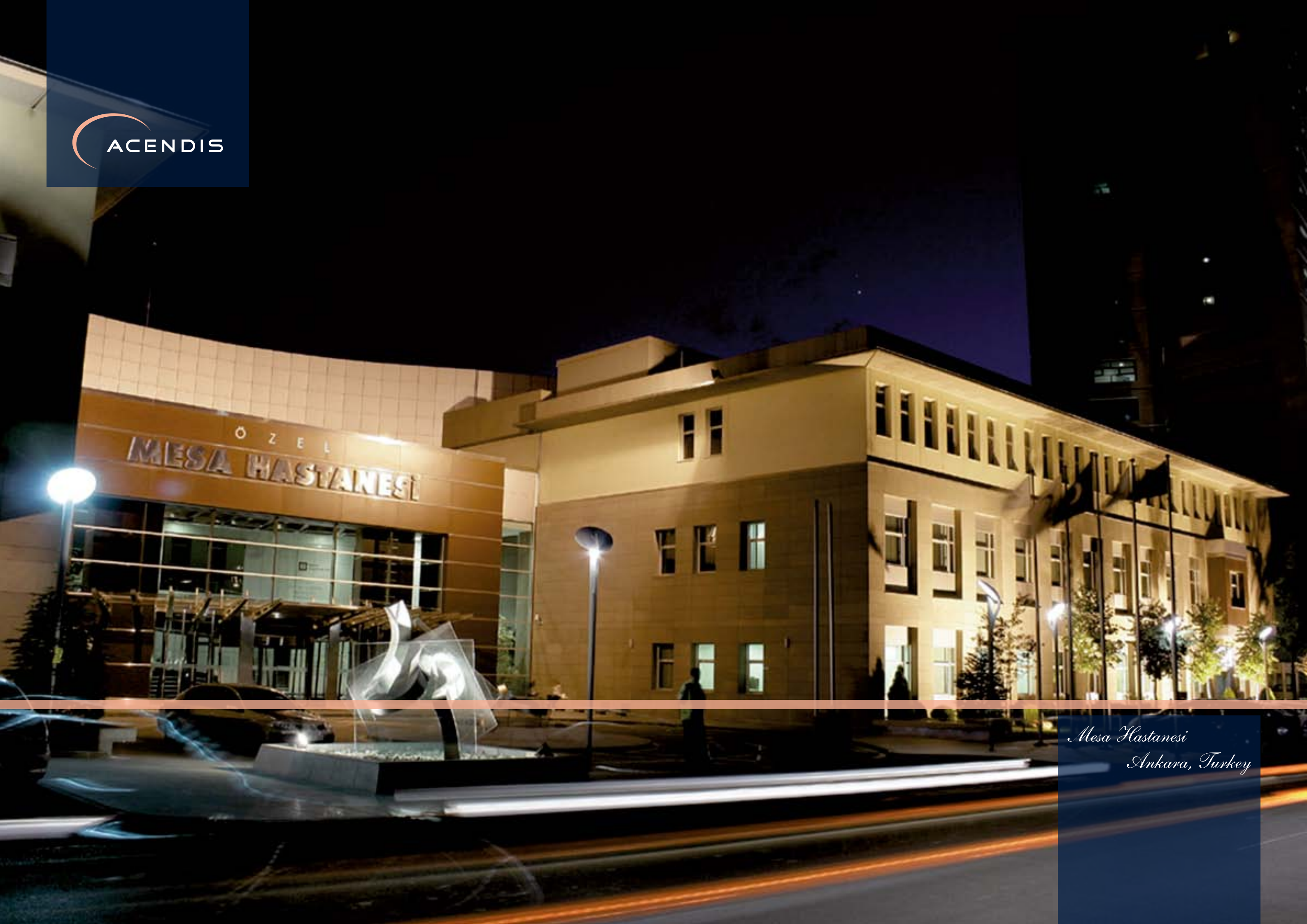
Mesa Hastanesi Ankara, Turkey